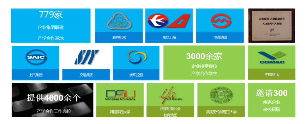
fig. 2 Co-op employers both at home and abroad

In 2014, the number of the co-op education employers is 4553, covering Hongkong, Macao, and some developed countries like Britain and America as well as 30 provinces all over the Chinese mainland except Tibet. Another 119 new cooperative bases join the program, which increase the total cooperative bases to 779.